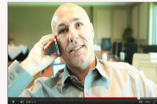
Hello My Name is Meetings and Events