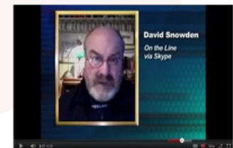
Decision Making in Complex Environments