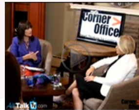
Building Collaborative Organizations