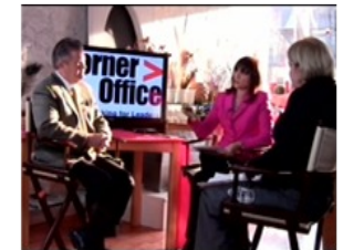
Business Experiments, Corporate Wayfinding™ #1